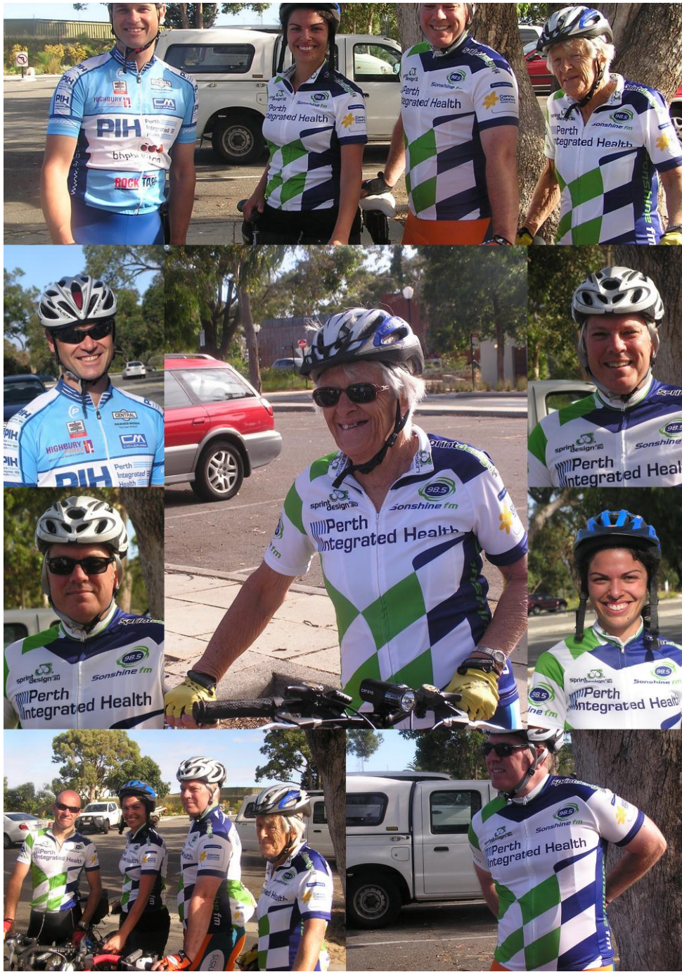
Team Uniform Cycling Course Participants

Unit 12, 8 Booth Place Balcatta (via Erindale Road) Tel: 9240 5266 Fax: 9240 1522