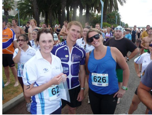
City of Perth Triathlon