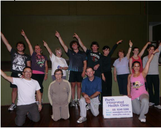
PIH Dance Moves Program-Rehabilitation