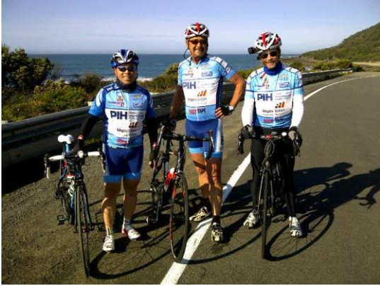
Amy Gillet Gran Fondo, Lorne