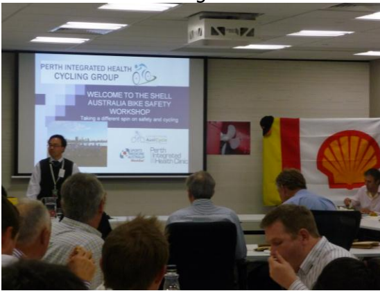
Shell Australia Corporate Health Program