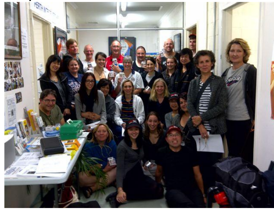
PIH Rocktape Workshop for Patients