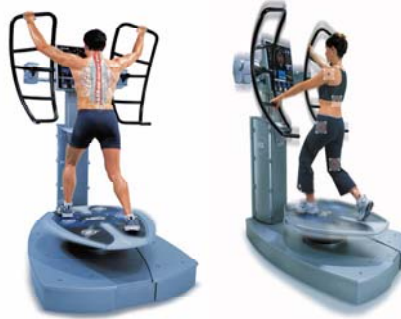
The Huber in action...

The Huber is well positioned now for the past 6 months at PIHC Performance Enhancement Clinic (PEC) to the benefit of our patients, children with balance and co-ordination conditions and many of our elite sports people.