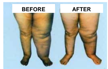
Key Module Treatment Results.